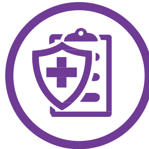
Emergency Relief & Response