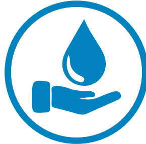
Water Sanitation & Hygiene