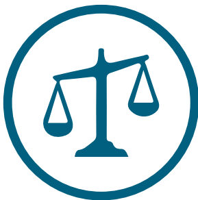
Advocacy & Social Justice