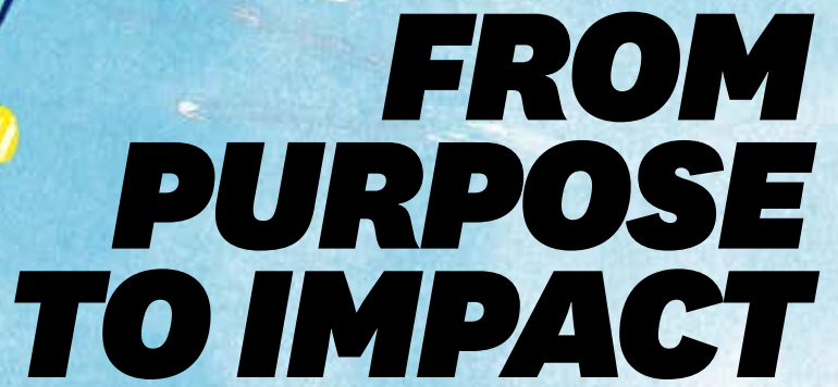
Figure out your passion and put it to work.